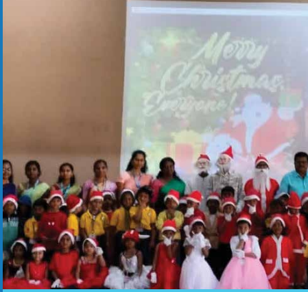
Christmas / Pongal / Diwali / Eid Celebrations